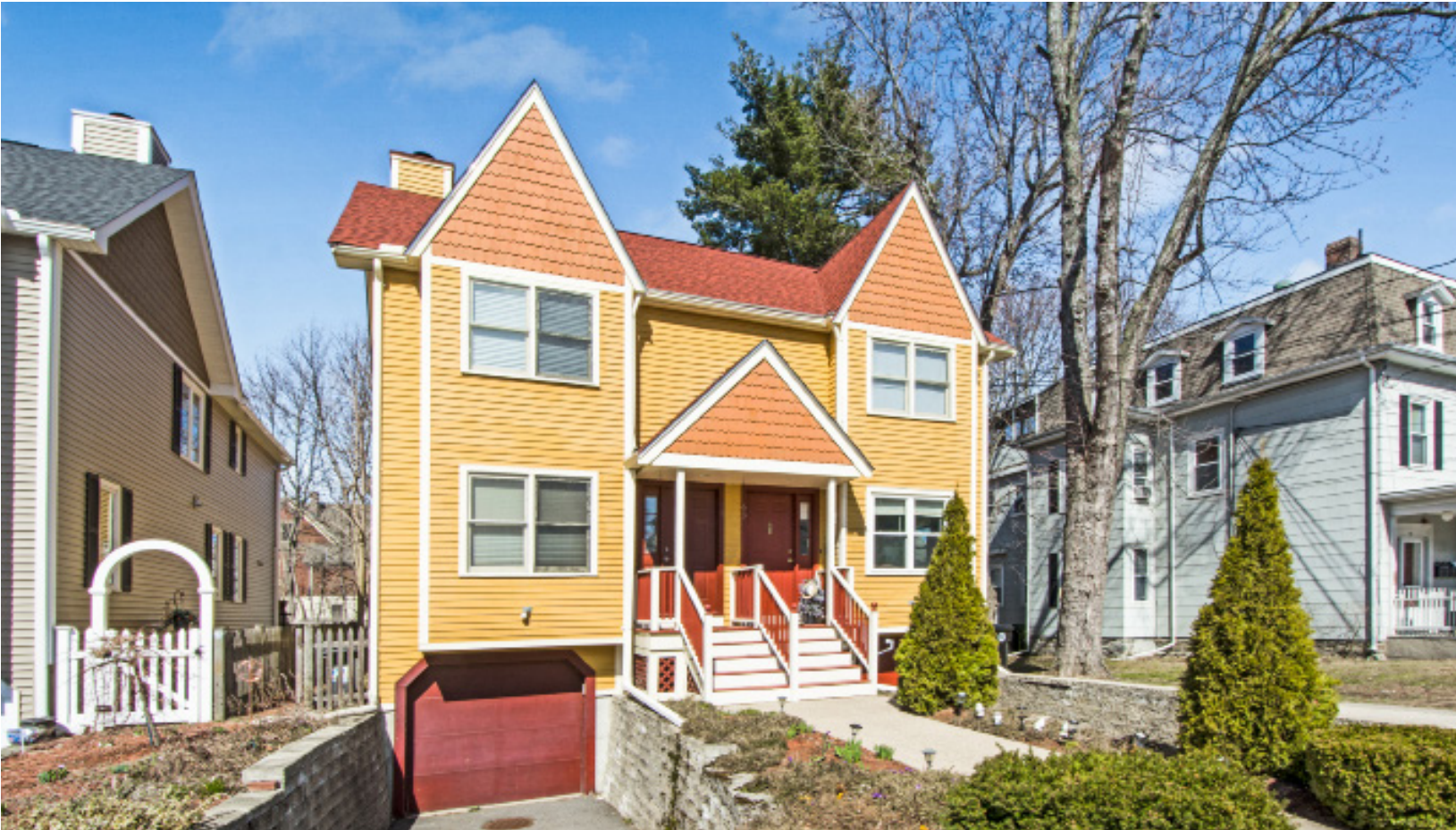
3 Bedroom | 2.5 Bath

Entering Watertown! Move-in ready duplex-style 3 bed 2.5 bath townhouse w/garage parking & private yard in convenient Watertown neighborhood. Perfectly situated on side-street between Newton Corner & Watertown Sq, this home is commuter's dream. Walk to MBTA buses to Boston (express) or Cambridge. Commuter rail & Greenline nearby. Easy access to MA-90, I-95, Rtes 20 & 16. Close to Charles River, path, parks as well as restaurants & shopping. This home has floorplan & space you are looking for! Open main level. Spacious living room w/fireplace. Separate dining area w/breakfast bar. Large kitchen w/plenty of cabinet storage & counterspace as well as stainless steel appliances. Slider to private deck & yard. Upstairs has 3 good-sized bedrooms & 2 full bathrooms—including master suite. Excellent natural light & gleaming hardwoods throughout. Gas heat & AC. Laundry area in basement w/dryer cabinet. Lots of closet space & storage. Many updates. Low condo fee. Pet-friendly. Don't miss it!